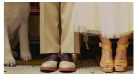
The New Bridal Shoe