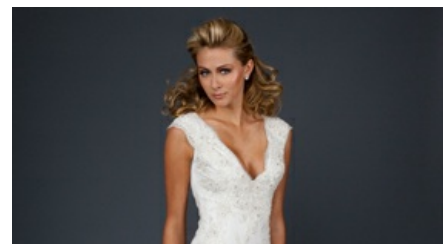
Choosing a gown that suits your body type