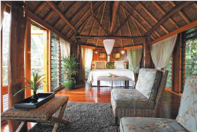
Nanise Bure Honey moon Suite at Namale Resort & Spa.

'Bachelorette'-inspired honeymoons in the South Pacific